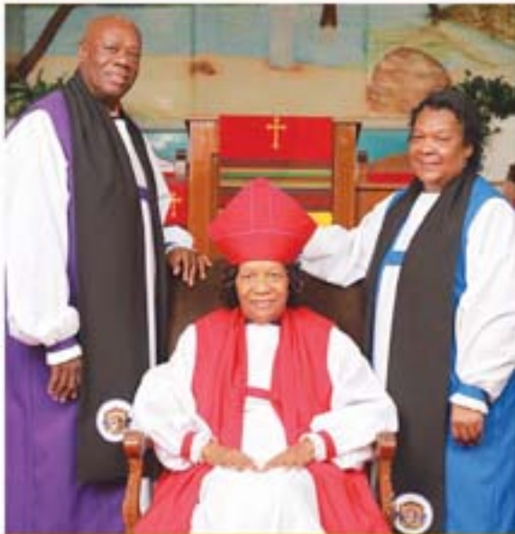
Vice- Bishop, Presiding Prelate & Advisor